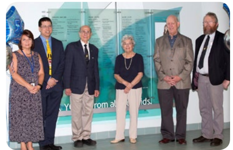
Fifty years after the Janeway opened its doors on August 9 th , members of today's leadership team celebrated with past and current Janeway physicians.